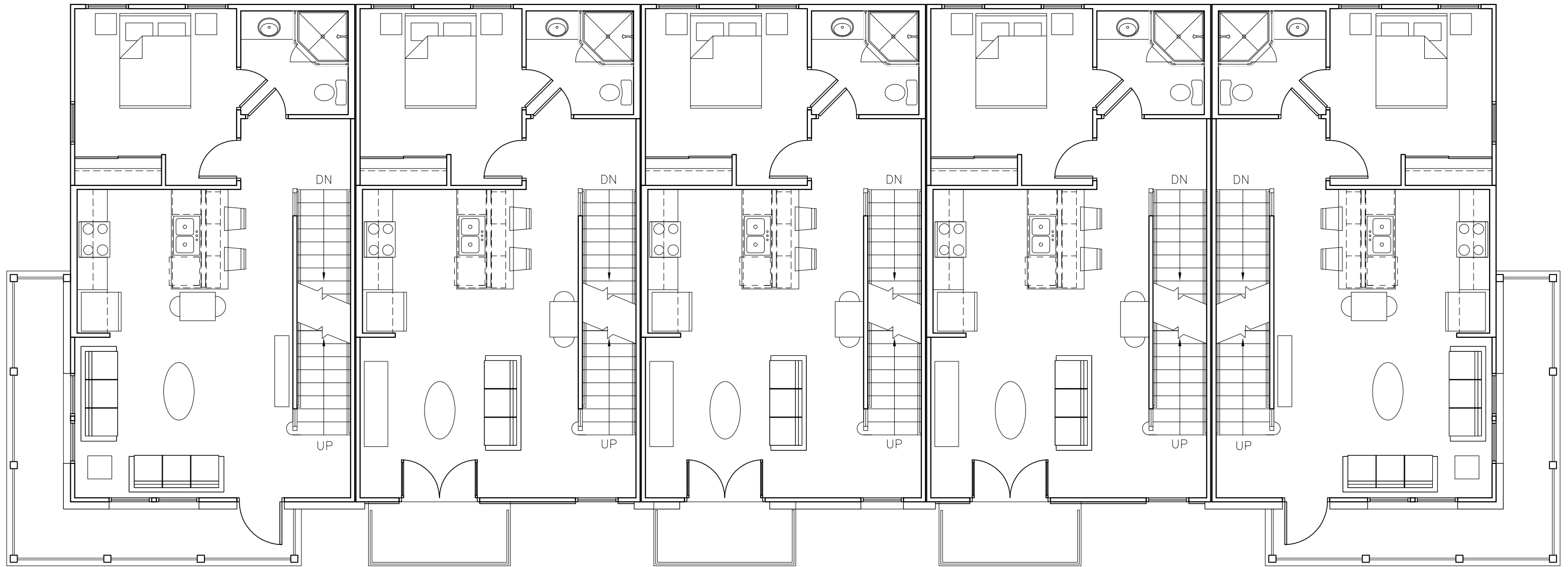
2 SECOND FLOOR 1/4" = 1'-0" N